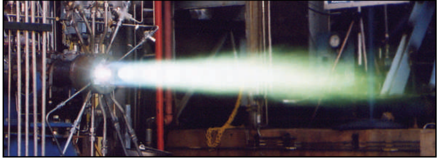
RS-84 Main Injector single element testing reduces the technical risk