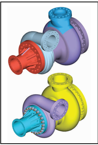
Advanced Turbomachinery designed for high reliability, maintainability, and operability